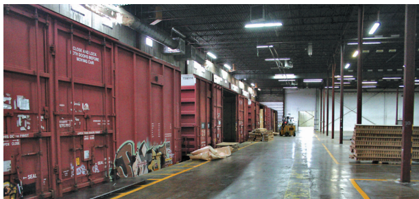
Pival operates over 1.4 million sqft in Canada including our new headquarters which boasts indoor rail access.

The other advantage that comes with centralizing is having a single point of contact.